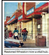
Restored Wheaton now a vital hub.